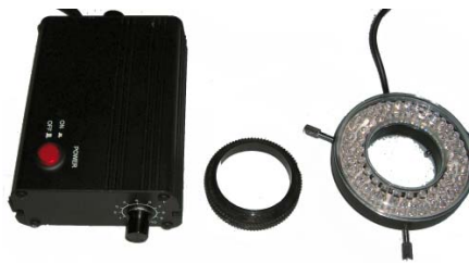
60 LED Ringlight GXMNORMA341103

A first rate and highly popular adjustable intensity LED ring illuminator with separate power controller.