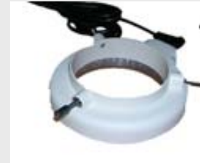
48 LED Ring Light GXMLED48T1

A low cost adjustable intensity LED ring illuminator with illumination control on the side of the ring light itself, supplied with a separate mains power adapter.